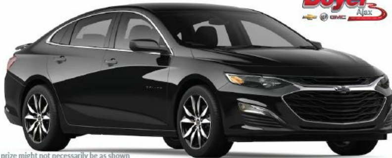
prize might not necessarily be as shown

PURCHASE YOUR TICKET IN PERSON OR BY PHONE AT THE AJAX PICKERING HOSPITAL FOUNDATION 905-683-2320 X 11501 MONDAY TO FRIDAY, DURING REGULAR BUSINESS HOURS.